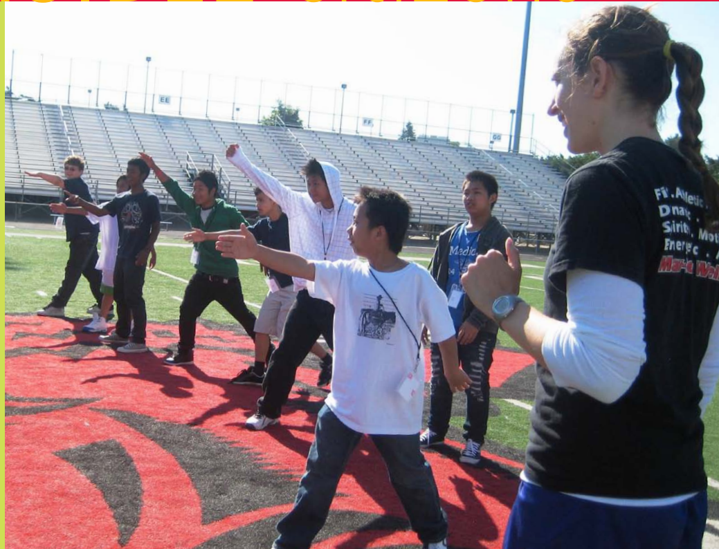
College of Education students engage with students from Lewis and Clark Middle School in an annual summer workshop held on the UNO campus.