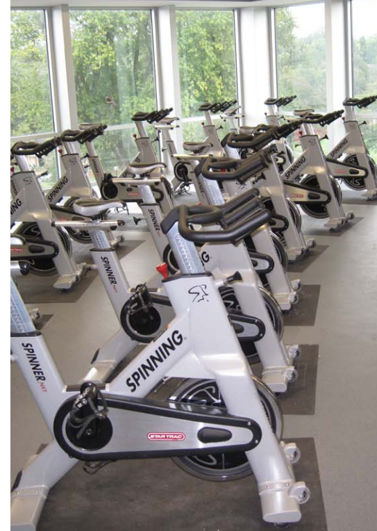
The renovated spaces include a "Spinning" Room and a greatly enlarged weight lifting and exercise area.

The expansion also allowed for Student Health to move from the Student Center to expanded and improved spaces in HPER. A wet classroom adjacent to the swimming pool and large windows in the two expansive exercise rooms seem to especially stand out as unique and special spaces.