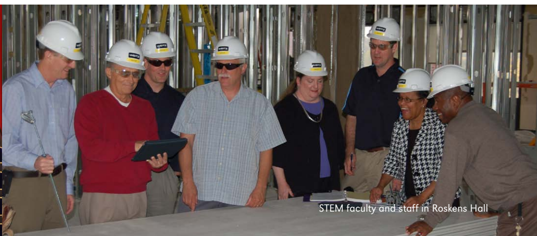
STEM faculty and staff in Roskens Hall