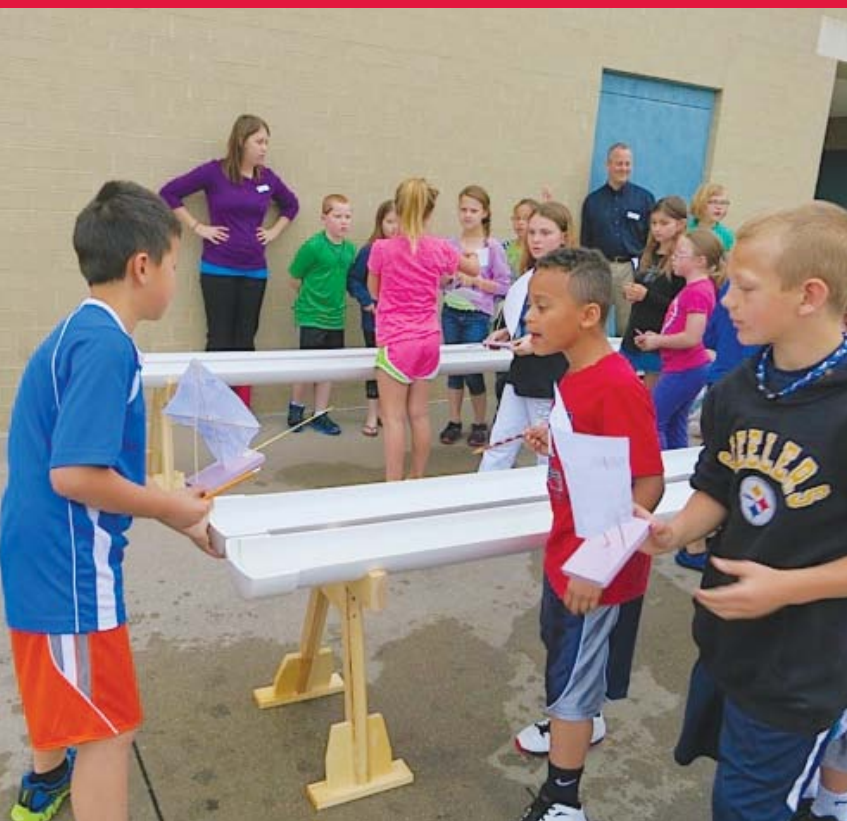
Collaborative STEM activity at Black Elk Elementary School

Sustainability. The University's Campus Priority plan defines Sustainability in terms of meeting "... the needs of the present without compromising the ability of future generations to meet their own needs." Preparing teachers who understand sustainability concepts is a major contribution to meet this goal. The new STEM classroom space was designed to enhance student understanding of the wise use of energy in heating and cooling the building. In fact, many energy saving concepts were incorporated in the design of all of our recently renovated facilities.