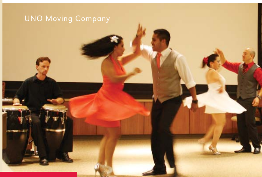
UNO Moving Company