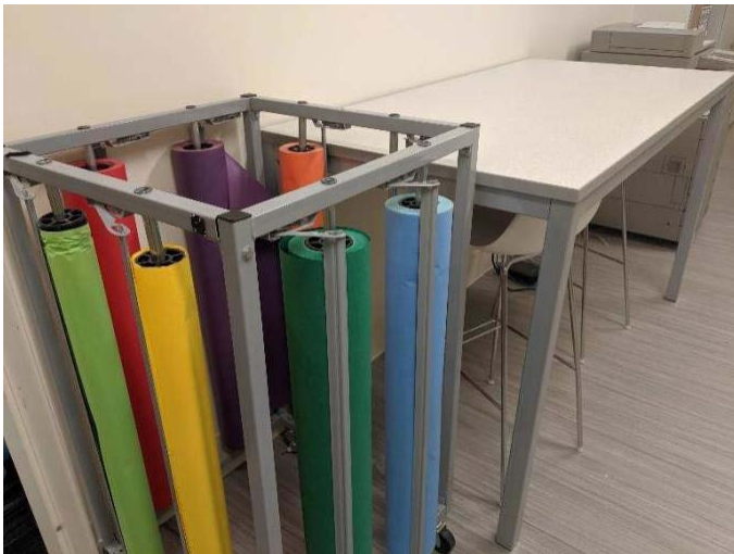
Butcher Paper and Worktable in the Workroom

Milo Bail Student Center Room 113 was designed with student organizations in mind. Computer stations with adobe suite software are available and are perfect for designing posters and fliers. The workroom functions as a space for creating and crafting posters, banners, or any organization projects that tend to get messy. Large rolls of colored butcher paper, craft supplies, and even a button maker are all available for student organization use.