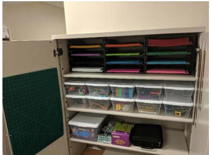
Workroom Supplies for Student Organizations