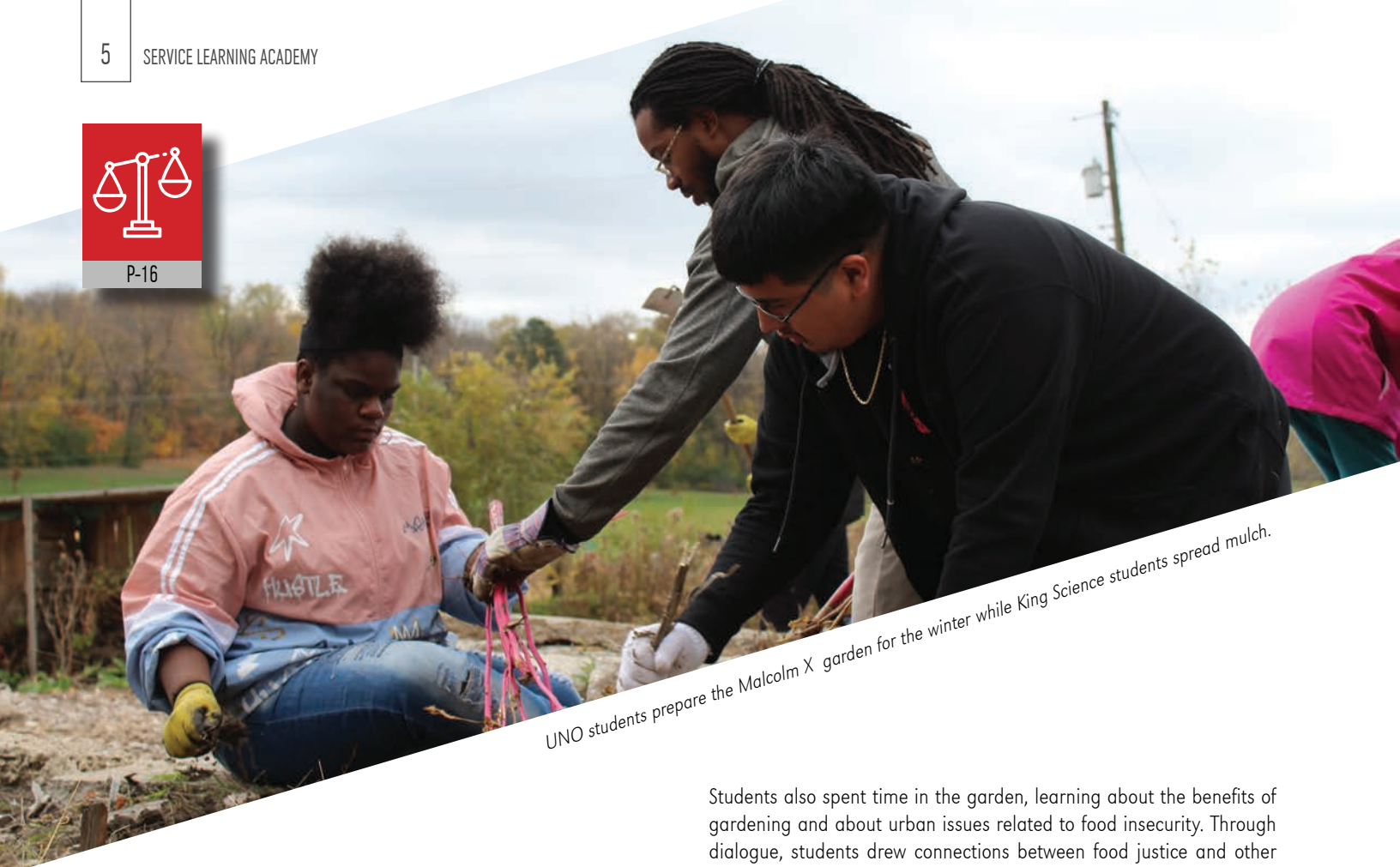
UNO students prepare the Malcolm X garden for the winter while King Science students spread mulch.