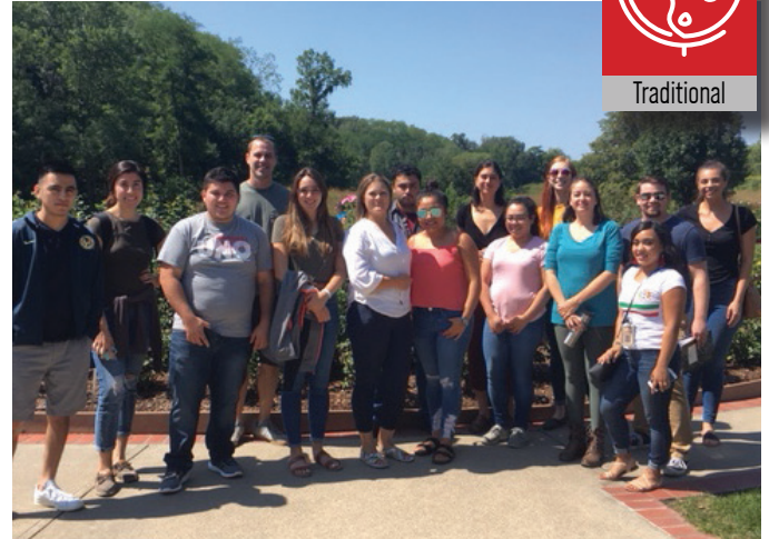
UNO students tour the Lauritzen Gardens.