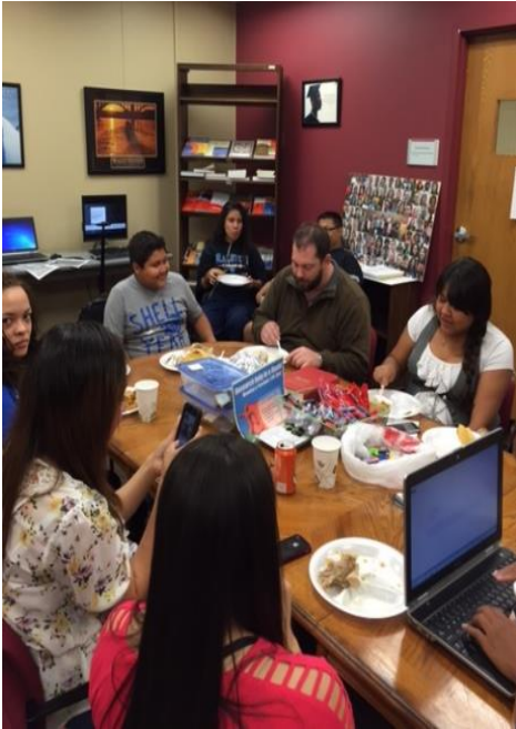
Project Achieve Food Day