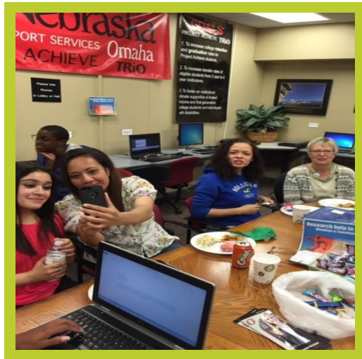
Oh, the many faces of Project Achievers!