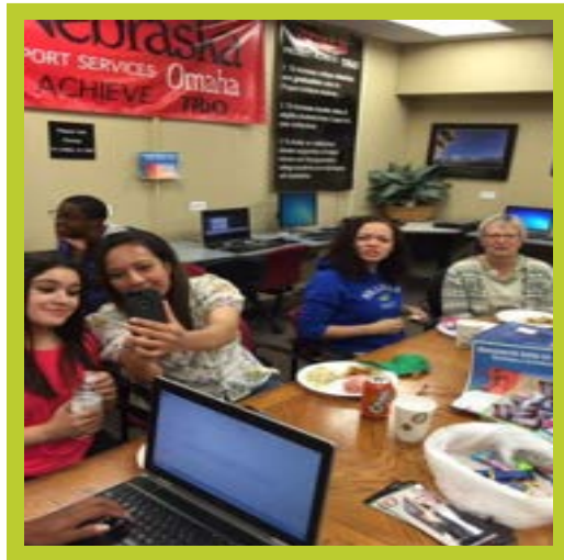
Oh, the many faces of Project Achievers!