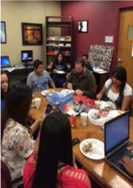
Project Achieve Food Day