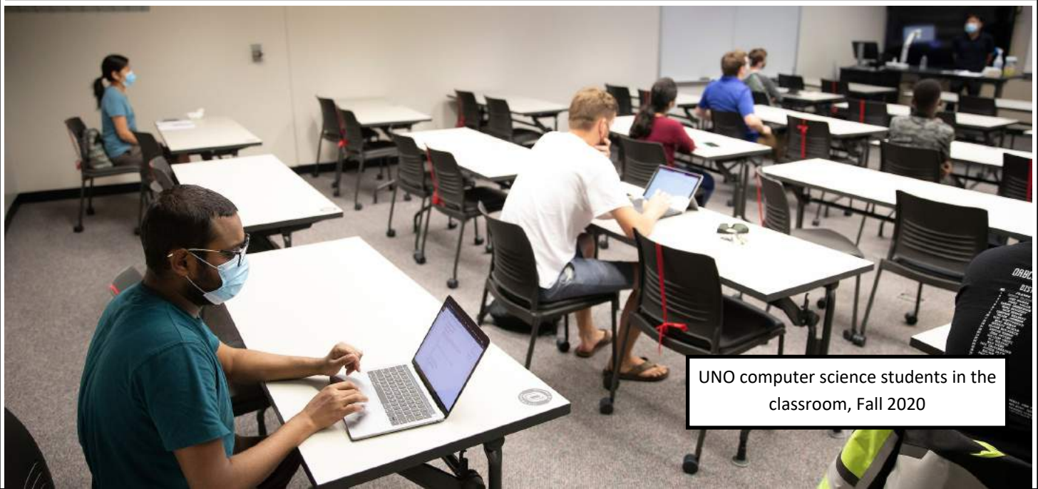
UNO computer science students in the classroom, Fall 2020