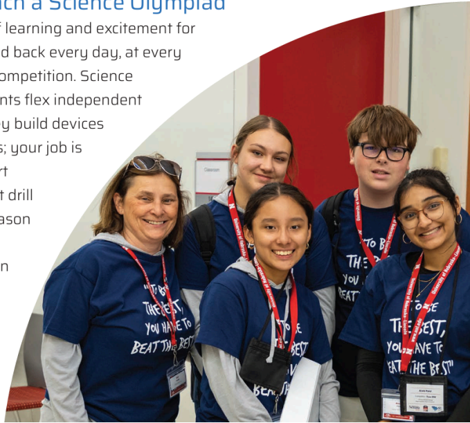
Science Olympiad Coach Recruitment Flyer

your love of learning and excitement for science gets reflected back every day, at every practice and every competition. Science Olympiad lets students flex independent learning skills as they build devices and study for events; your job is part talent scout, part cheerleader and part drill instructor. As the season progresses, you'll rediscover the reason you became a teacher.