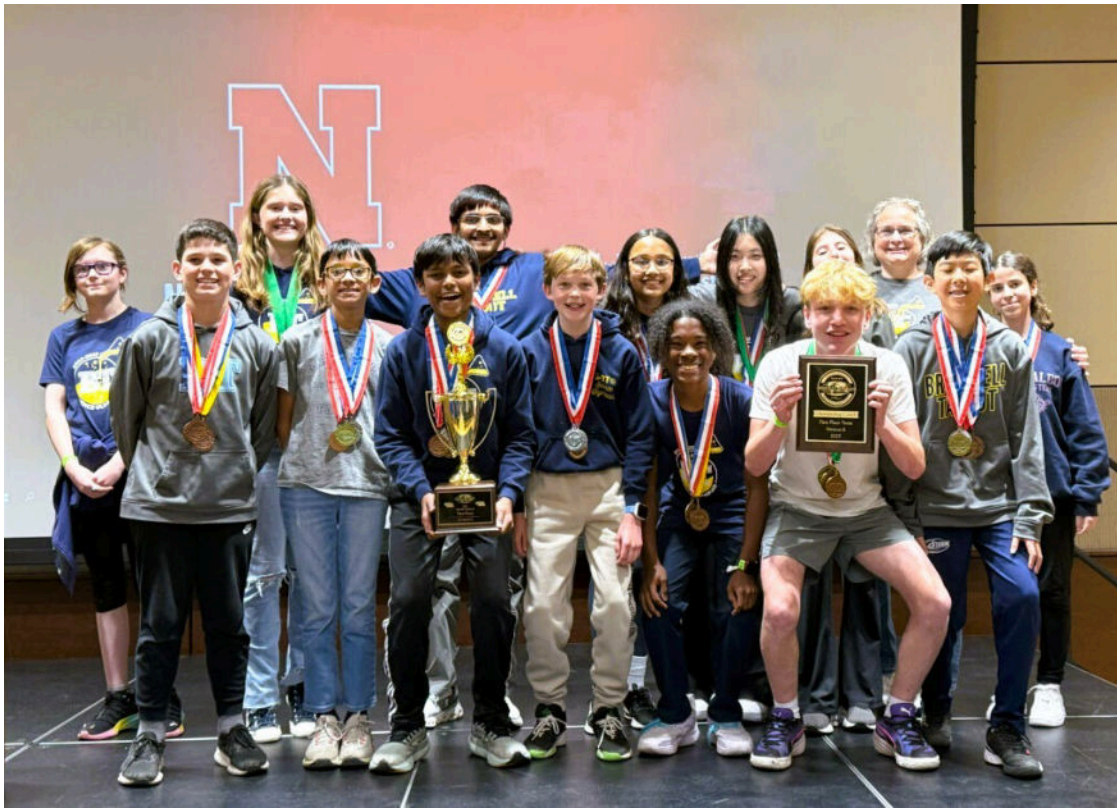
(Division C) Lincoln Science Focus High School