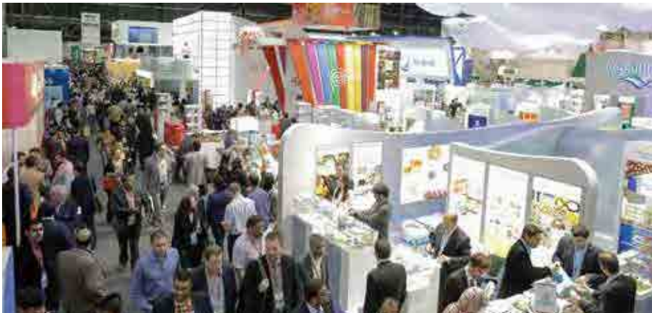
Gulfood, an annual food exposition at the Dubai World Trade Center