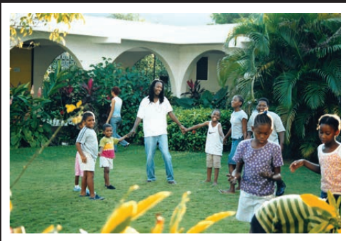
Caribbean Child Development Research Center