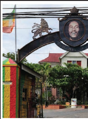
Bob Marley Museum