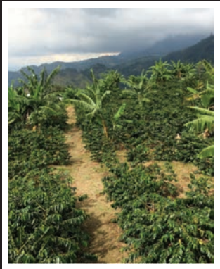
Blue Mountain Coffee Plantation