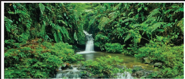
Brauilo Carillo National Park