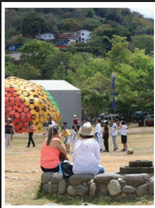
Parque La Libertad