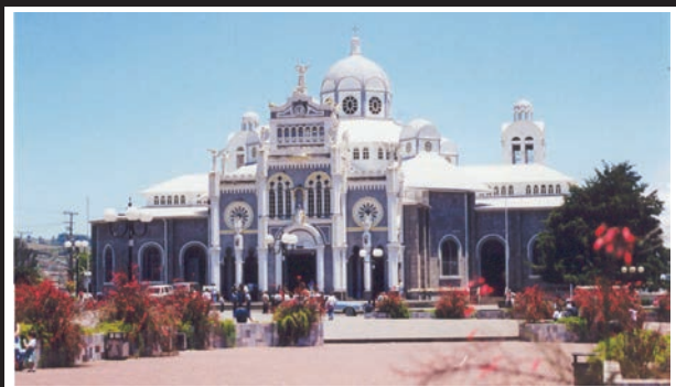
Cartago City Tour