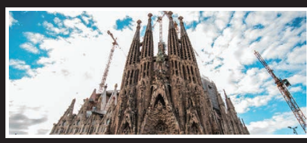
La Sagrda Familia