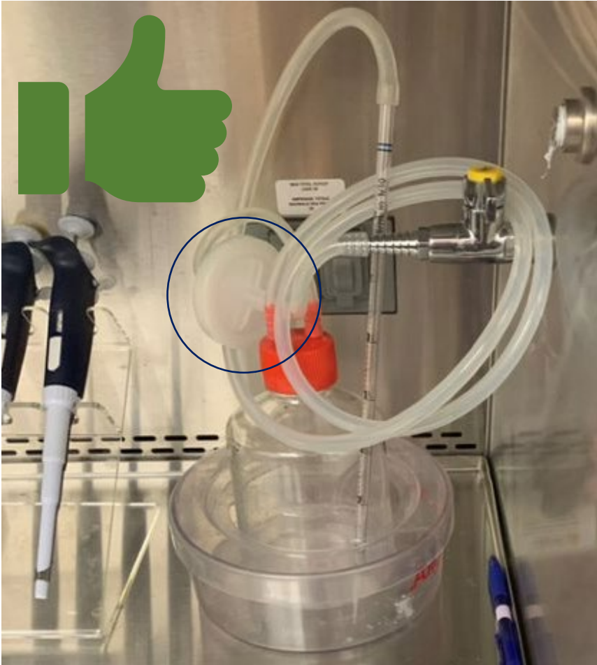
Figure 3 (Left):

Which image is more like your vacuum trap set-up? How can you make yours safer?