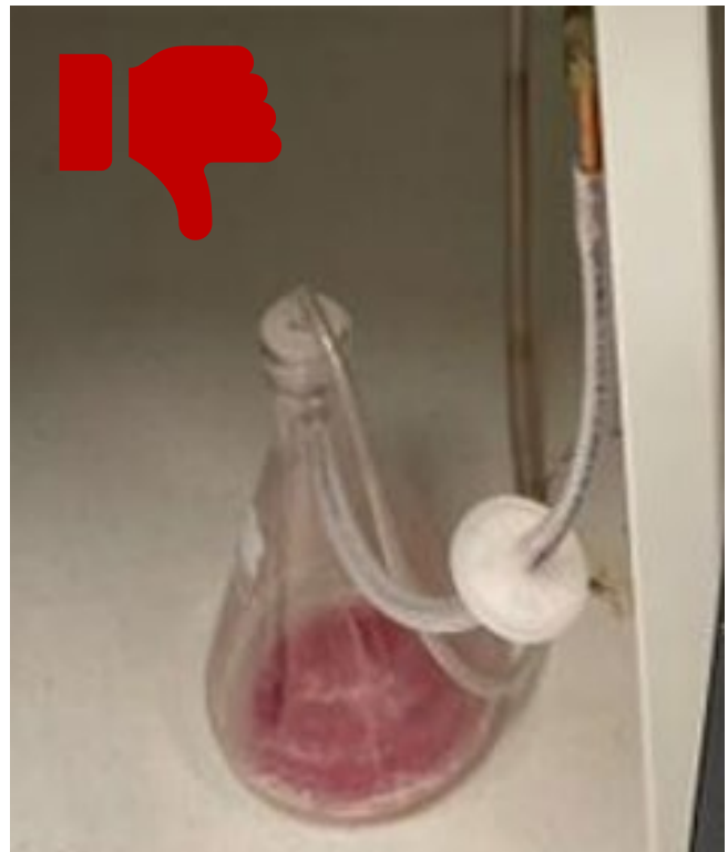
Figure 4 (Right):