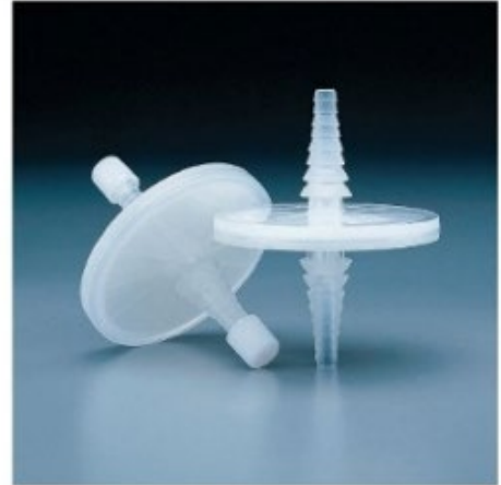
Figure 1 (Right): In-line filters should be installed after flasks and before the house vacuum connection. Based on Institutional Policy and regulations set by OSHA, CDC, and NIH. Various filter options are available for purchase. Consider the following options: MilliPore Sigma Filters (SLFA05010, pictured ), Corning Filters (CLS431227-12EA), Midwest Scientific Filters (RJF502210), or other comparable filters.

Substance and task-specific risk assessments should be used to determine the overall design, maintenance needs, and standard operating procedures for pressure and vacuum systems. What substances are involved? How will it be used? What are the hazards and associated consequences? How can risks be mitigated?