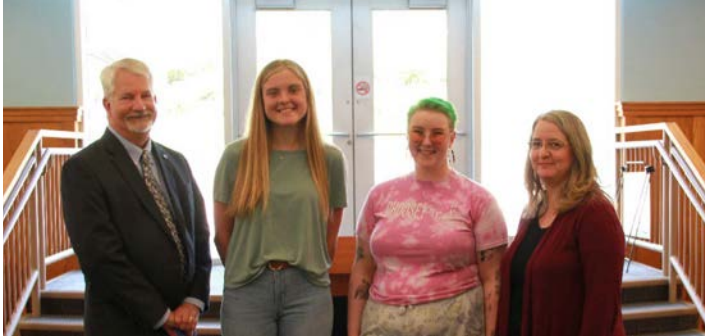
Library Friends Distinguished Service Award Recipients