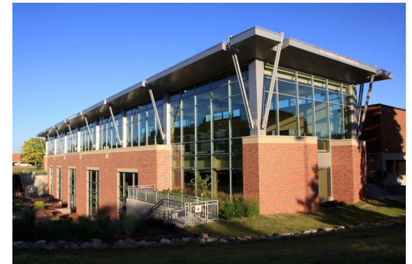
Clockwise from above: Criss Library, Trisch Garden, and Library Café