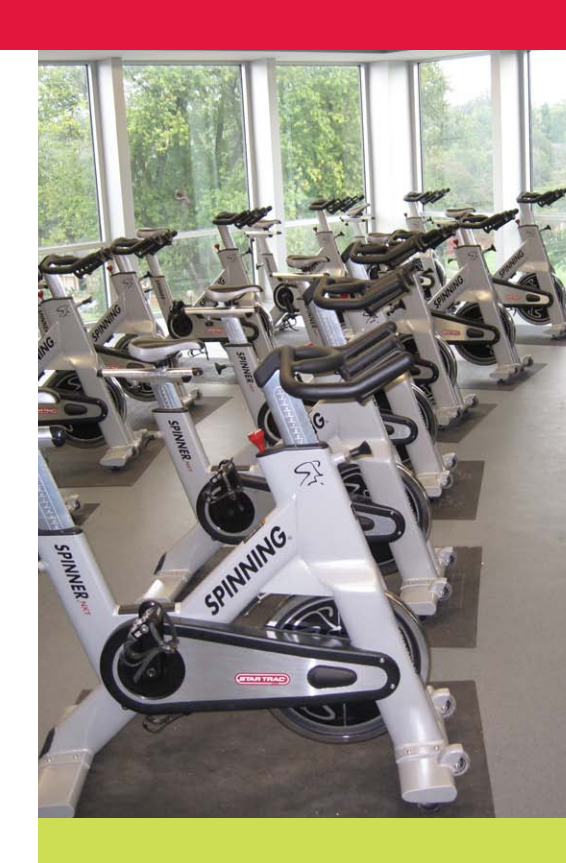
The renovated spaces include a "Spinning" Room and a greatly enlarged weight lifting and exercise area.

The expansion also allowed for Student Health to move from the Student Center to expanded and improved spaces in HPER. A wet classroom adjacent to the swimming pool and large windows in the two expansive exercise rooms seem to especially stand out as unique and special spaces.