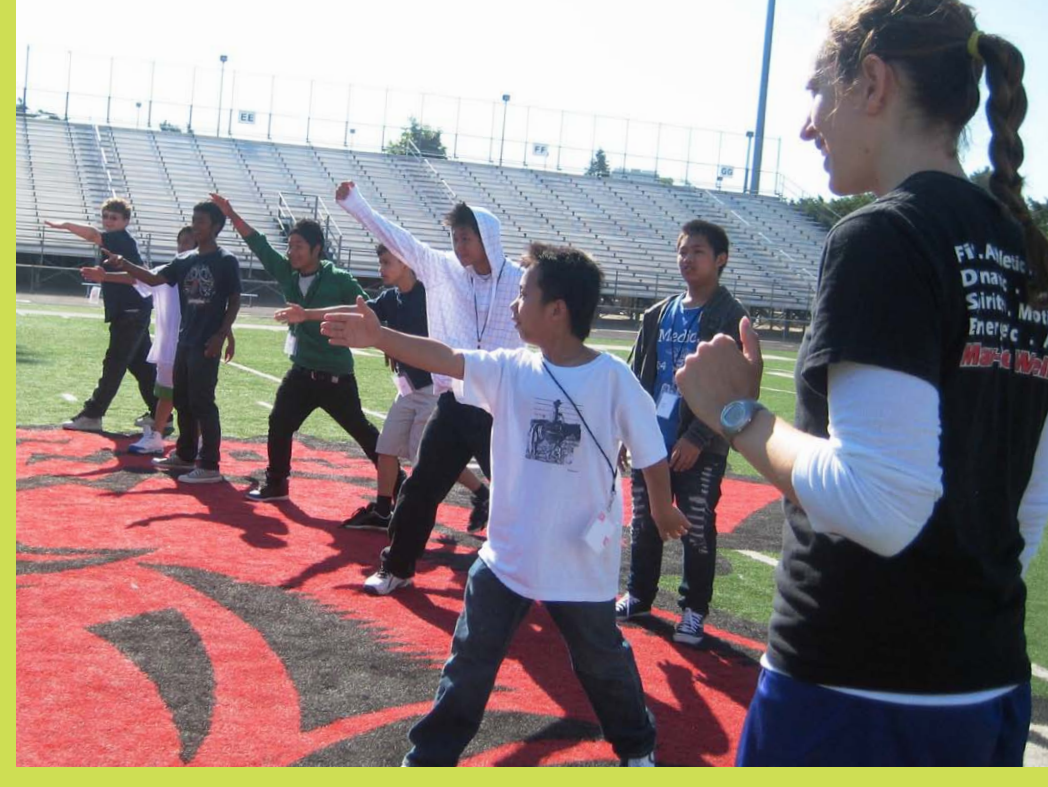
College of Education students engage with students from Lewis and Clark Middle School in an annual summer workshop held on the UNO campus.