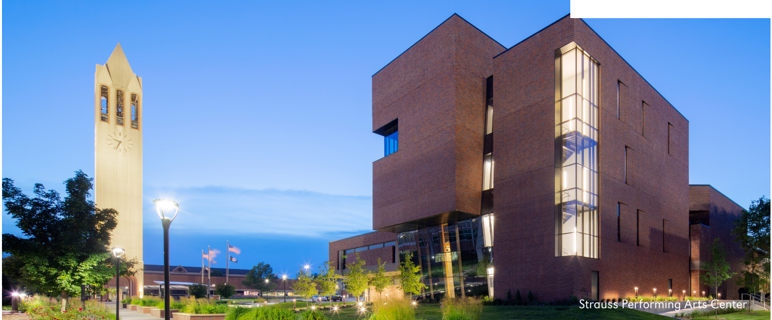
Strauss Performing Arts Center