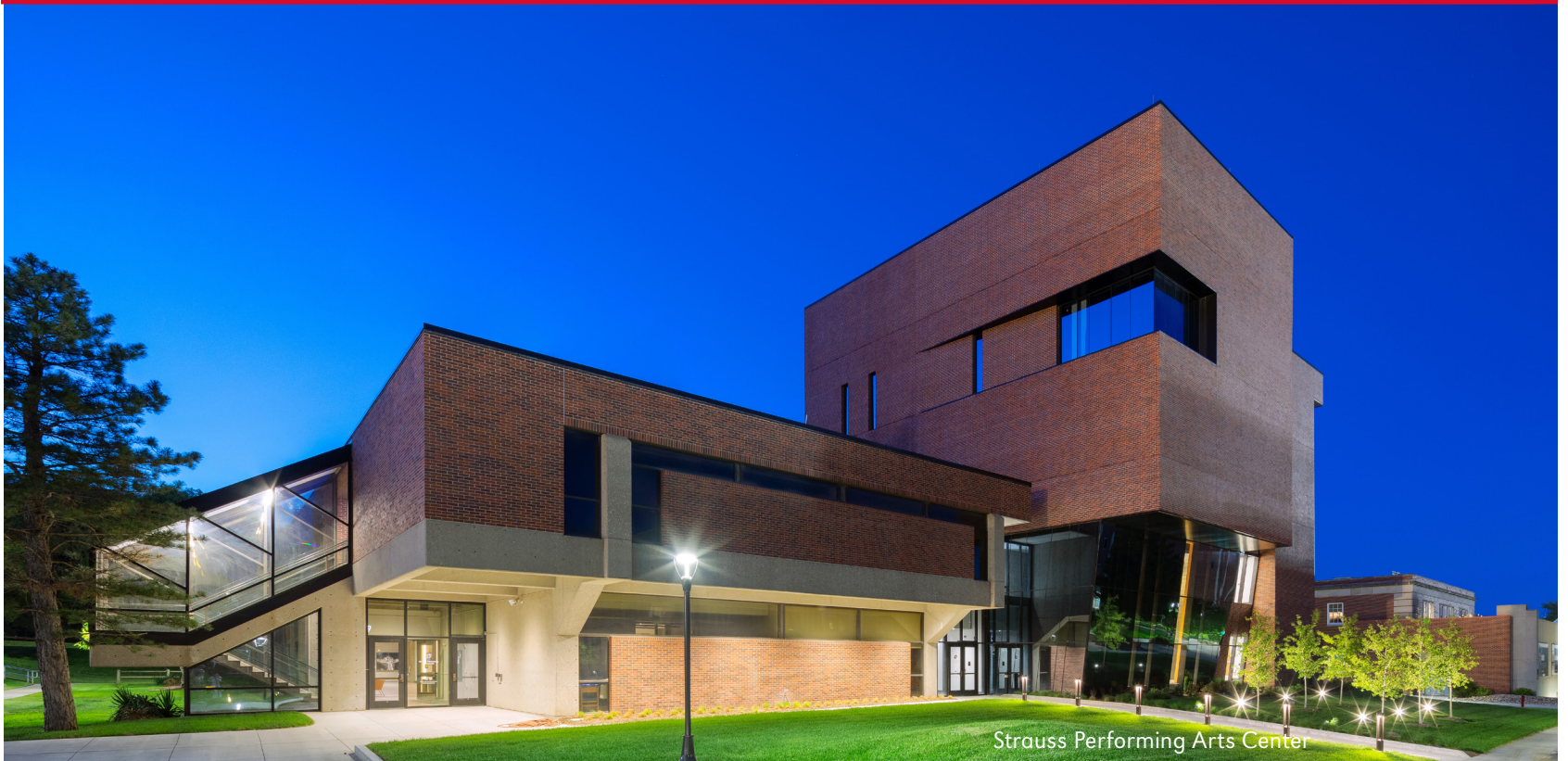
Strauss Performing Arts Center