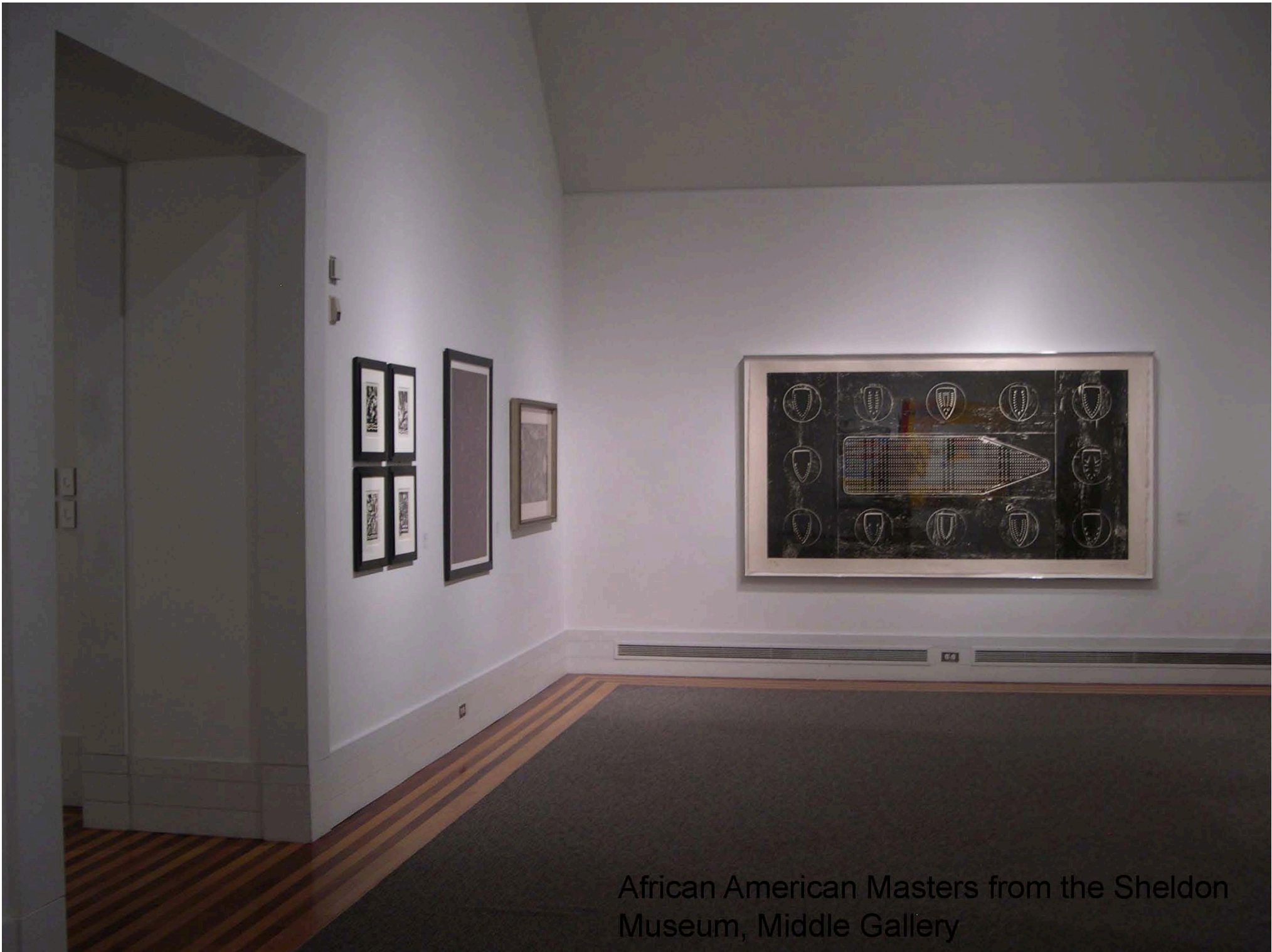
African American Masters from the Sheldon Museum, Middle Gallery