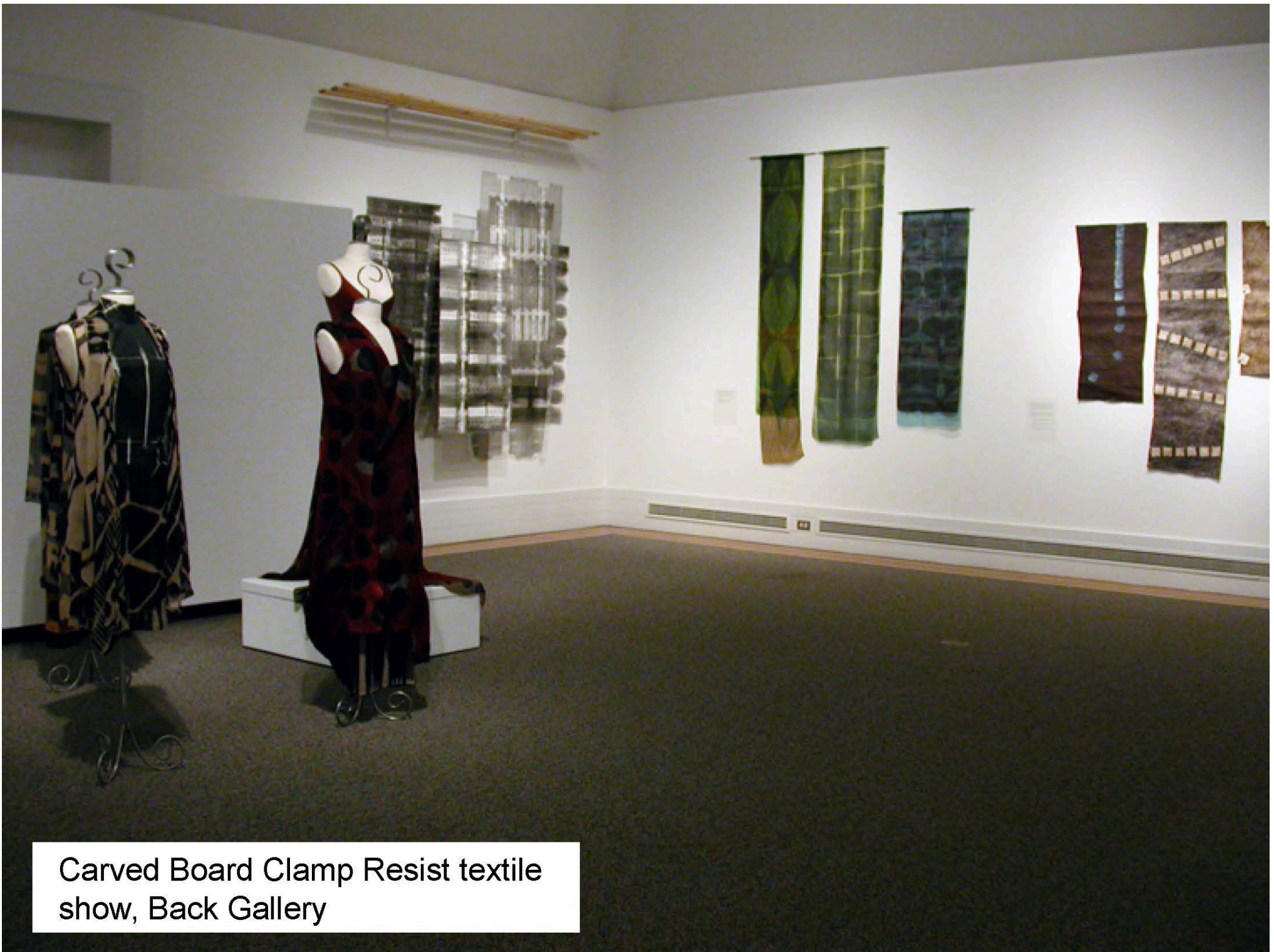
Carved Board Clamp Resist textile show, Back Gallery