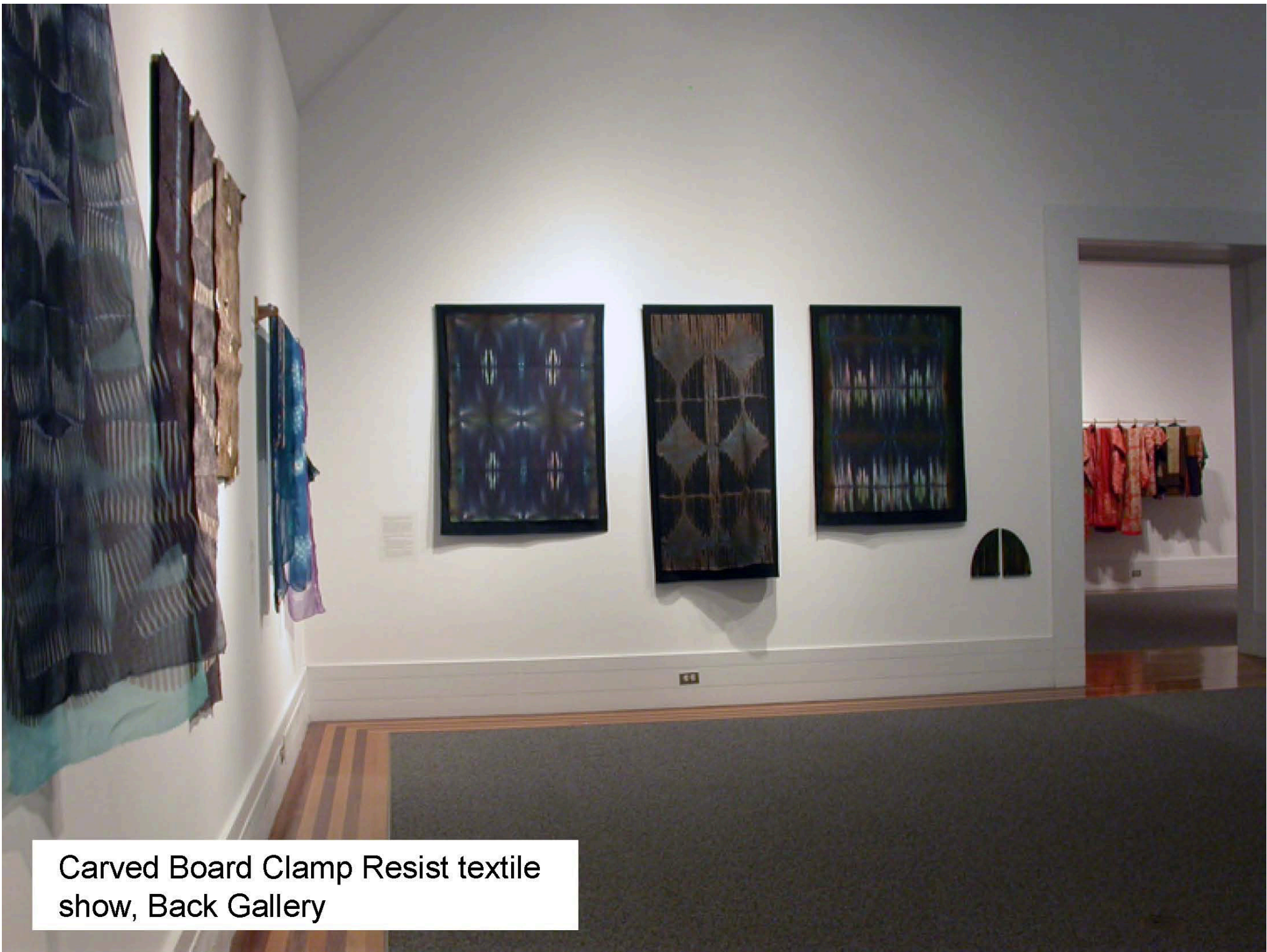
Carved Board Clamp Resist textile show, Back Gallery