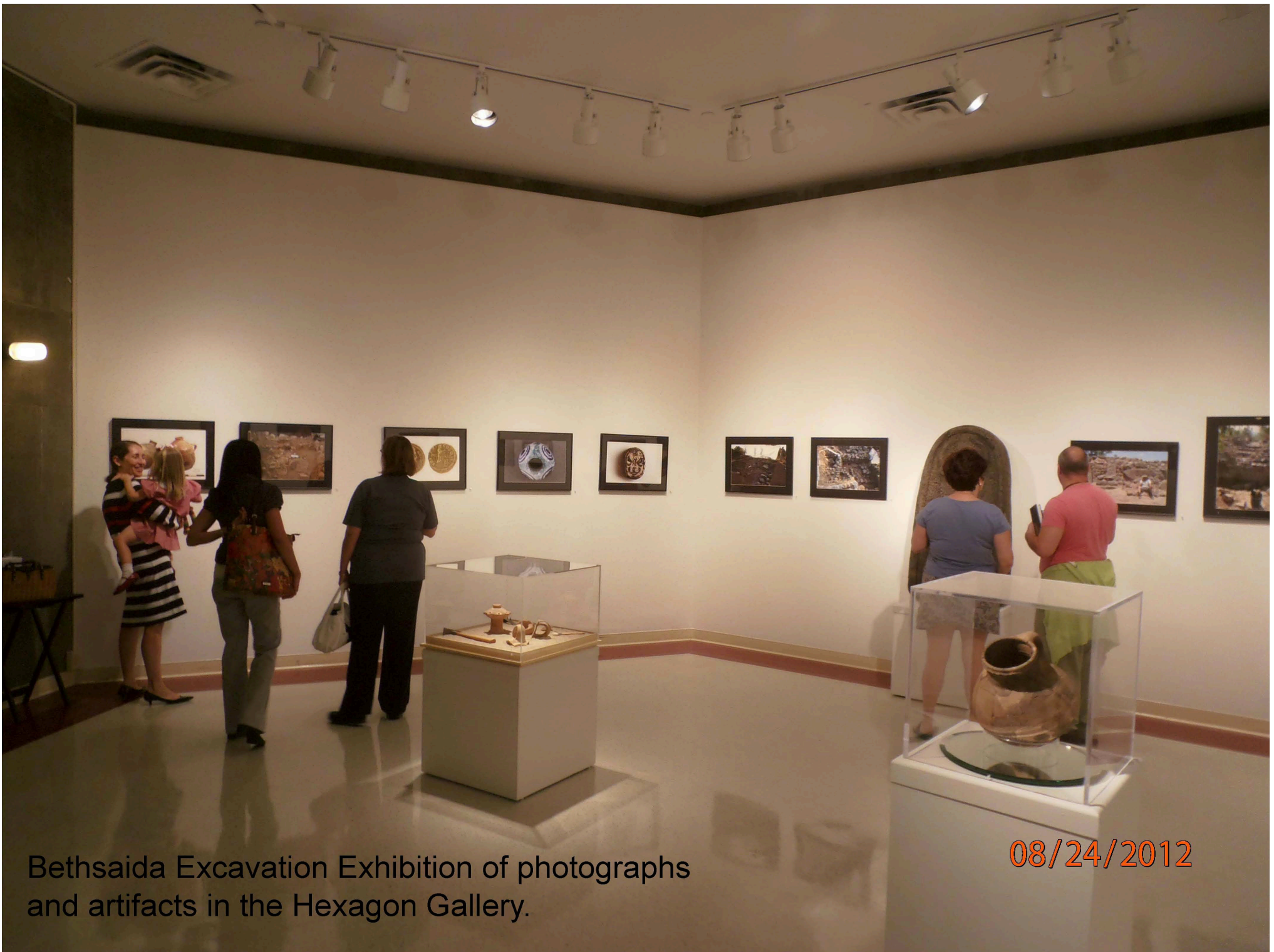
Bethsaida Excavation Exhibition of photographs and artifacts in the Hexagon Gallery.