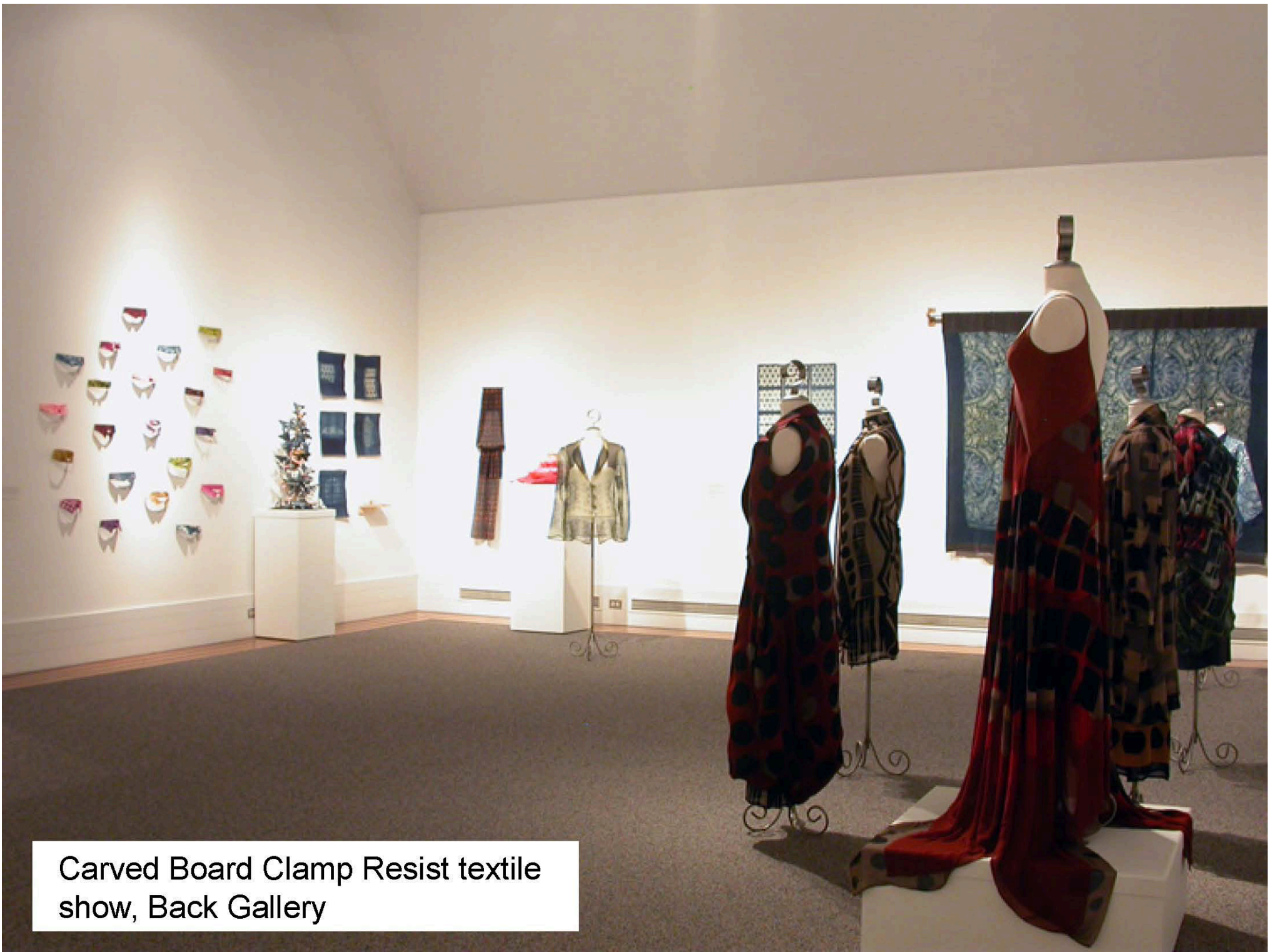
Carved Board Clamp Resist textile show, Back Gallery