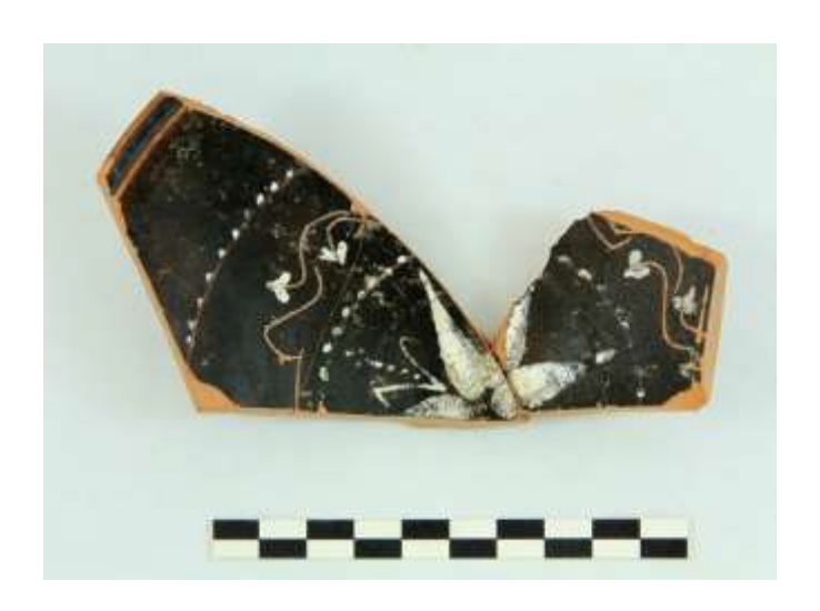
Lilies and ivies, white on black background, a West Slope Style decoration on a bowl from Bethsaida. Second century BCE.