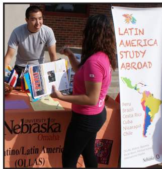
OLLAS table at the 2012 UNO Study Abroad Fair

The major's focus is the understanding of Latino immigrants, critical issues in Latin America, and the linkages among communities and forces of change across the Americas.