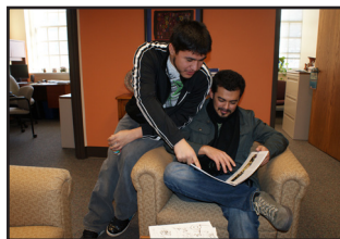
LLS & CLS students study an OLLAS report

The focus of the minor is primarily on U.S. Mexican and Latino communities.