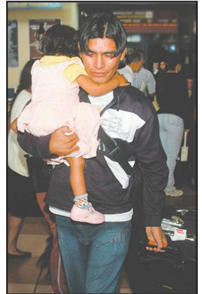
Bolivian immigrant with daughter in Spain

MIGRATION can severely stress social and intimate relations. It can modify gendered structures and assumptions as men and women (at home and abroad) encounter new constraints and adopt new roles (at home and at work). Dr. Tapias explores these issues through a study of Bolivian immigrant men's changing attitudes toward ambition and the related unease with which they must perform "new masculinities."