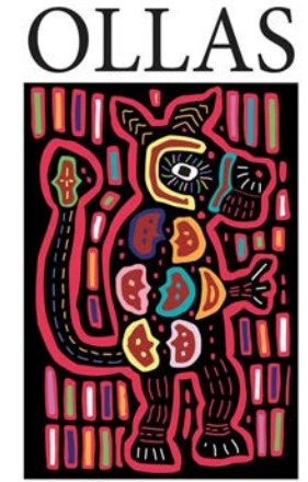
Office of Latino/Latin American Studies

Please see the following pages for more information about the films in this series, or visit the series web page at <a href="http://bit.ly/2OS2a3e">http://bit.ly/2OS2a3e</a>.