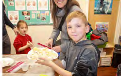
A big "Thank You!" to all of our families who took part in our Lunar New Year celebration of making dumplings- We hope you enjoyed them!