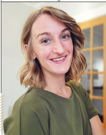
Maggie Smith Graduate College