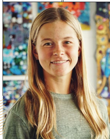
Emma Hain College of Engineering (UNL)