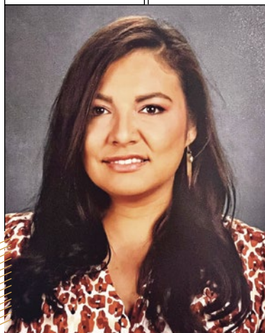
Theresa Schmitz Graduate College