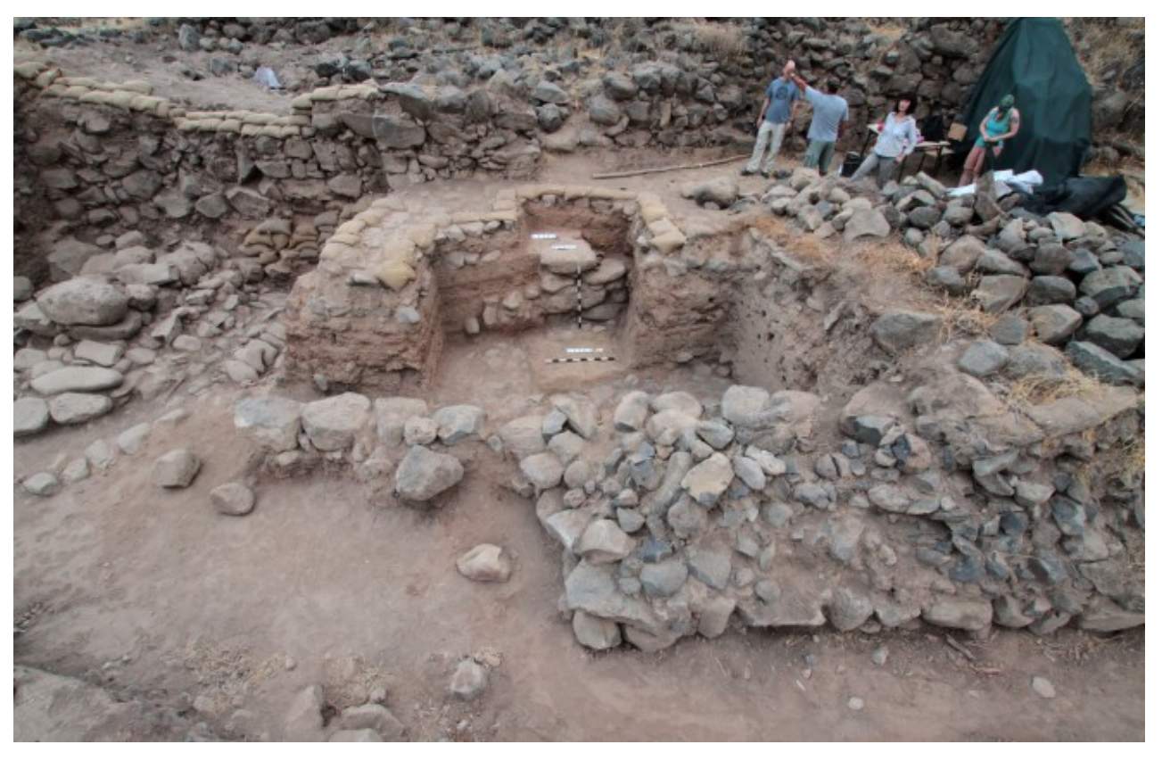
Figure 2, City Gate of Stratum VI, 11th to 10th centuries BCE.

The first 30 years of Bethsaida Excavations; what have we learned? Where should we proceed?