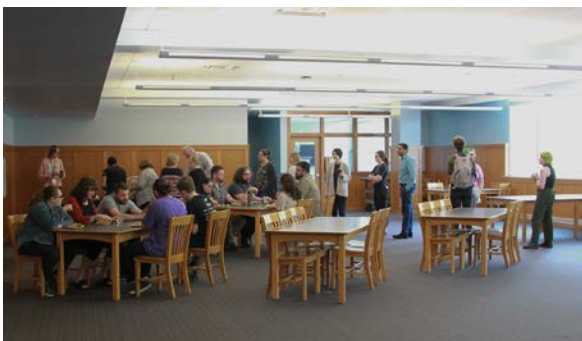
2023 Distinguished Service Award Luncheon