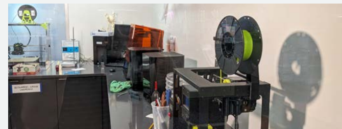
3D Printers in the CPL