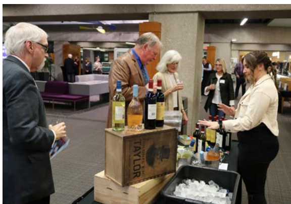
2024 Collections Uncorked Event - Library Friend's Signature Fundraiser