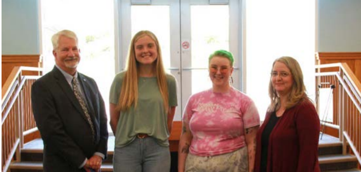
2023 Library Friends Distinguished Service Award Recipients