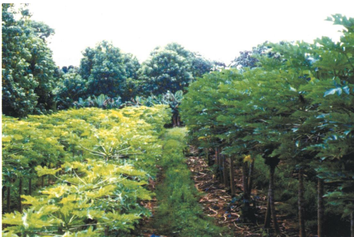
FIG. 1. Field plot in Hawaii showing papaya trees with and without transgenic disease resistance. The small, yellowish trees on the left have the ring-spot virus, whereas the larger, transgenic trees on the right do not (see Box 2).

example, transgenic Escherichia coli that produce human insulin have replaced animal-derived insulin for medical uses; also, genetically engineered bacteria produce rennet, which is used commonly by cheese processors in the United States and elsewhere. Bovine growth hormone produced by transgenic bacteria has been used to increase milk production in many U.S. dairy farms. Transgenic microorganisms are being developed for bioremediation of toxic compounds (Box 4), and for removing excess carbon dioxide from the atmosphere. Experimental field tests of microorganisms intended for release into the environment include bacteria with visual markers, biosensors of toxic chemicals, insecticidal properties, and reduced virulence.